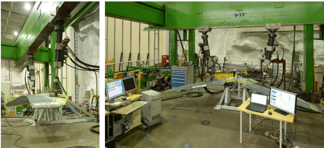
Figure 1. Hawk Mk 51/51A/66 tailplane full-scale fatigue test set-up.

The tests were installed under a portal loading frame, and the tailplanes were attached to the custom made test bench bolted on the test hall floor (Figure 1). The aerodynamic resultant load location was analyzed with Hawk CFD and FE models in four different flight conditions. Aerodynamic loads were transferred to the FE model, and the FSFT loading method was also modelled. The location of the resultant load was selected by the criteria of obtaining similar stress distribution in both models, which corresponded well to the OEM's tailplane aerodynamic centre. Test loads were applied with two symmetrically mounted 50 kN servo hydraulic actuators. The test spectrum was based on i) the strain gage signal at the top skin of the tailplane centre box (S15) of two FINAF OLM Hawks: HW-368 (Mk 66) and HW-319 (Mk 51A), and ii) on today's real, flight hour and syllabus based usage spectrum of the FINAF flights. However, the developed spectrum was not a general Basic Operational Spectrum (BOS), because it was further edited and verified with stress life analysis to match correctly the needs of the FSFT's command system feeding both buffet and manoeuvring components to the test symmetrically at the same time.